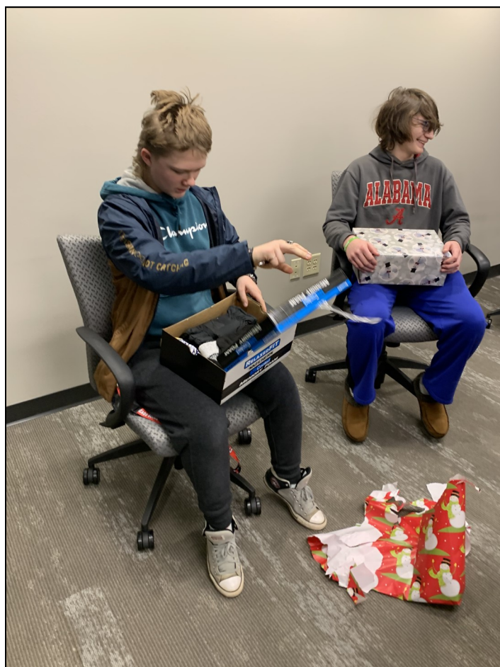
Many thanks to everyone who made this Christmas a little brighter by filling a shoebox for one of the residents of McCrossan Boys Ranch! The kids really enjoyed them!